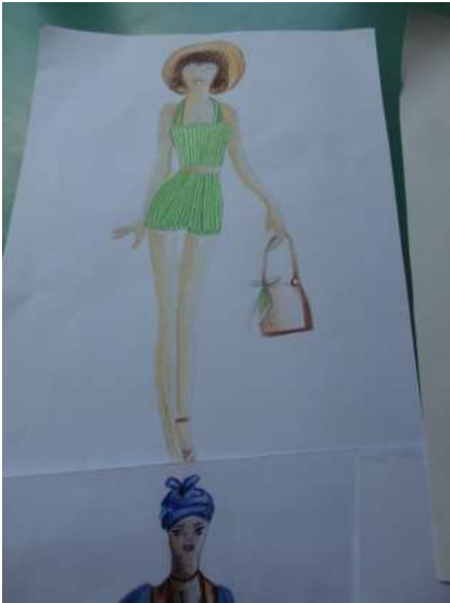
Fashion drawing by Tomislava Šmit